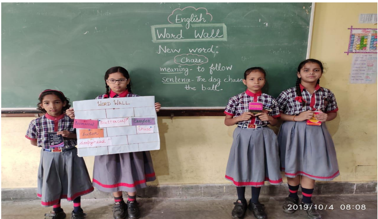
Activity-1 Based on Elementary Education Programme